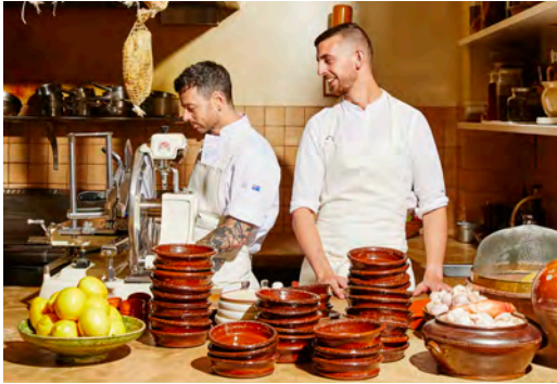
CHEFS & DINING OUT