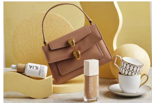
A LUXURY LIFESTYLE