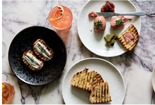
RECIPES & MENUS